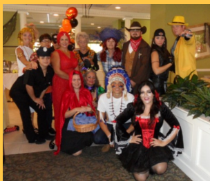
Arbor Trace Staff