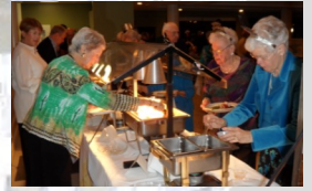
Everyone enjoys the buffet, including lobster tails